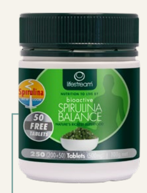
Spirulina Balance 200 +50 tabs FREE $34.90