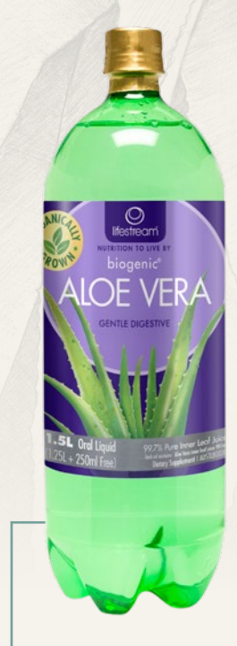
Aloe Vera Juice 1.25L +250ml FREE $34.90

New to the Lifestream range are their Advanced Probiotics Mood + Immune and Advanced Probiotics Metabolise. Where the former is symbiotically formulated with four premium strains and a prebiotic to promote immunity, gut health and healthy mood balance, the latter contains seven specifically chosen strains and a prebiotic that supports the metabolic system and promotes healthy weight maintenance.